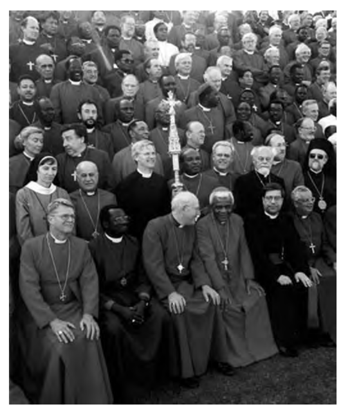
15. The worldwide faith: bishops at the 1998 Lambeth Conference

such declared that to allow homosexual ordination would be 'to commit evangelical suicide'.