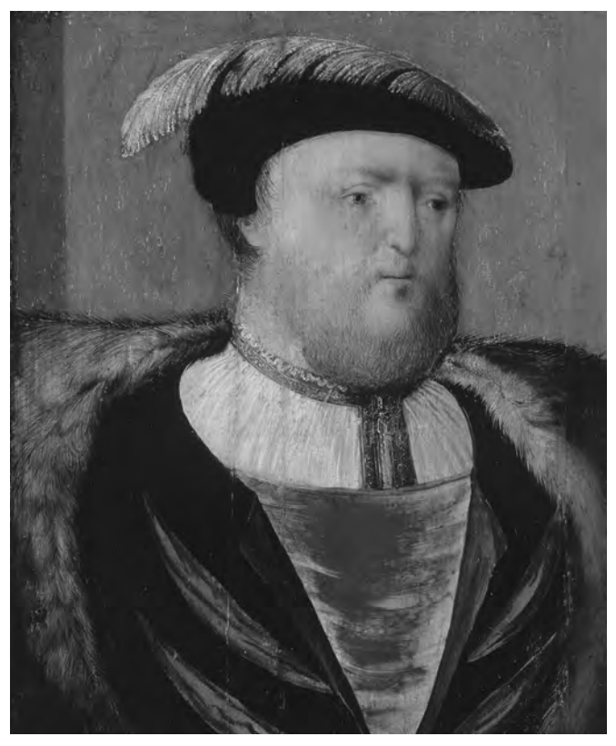
2. Henry VIII, creator of the independent English Church, in the late 1530s

In early 1532, Henry (Figure 2) sought an act of submission from the clergy to ensure that all ecclesiastical legislation would be subject to royal approval. Again, this was far from plain sailing. On 11 May, for instance, the King had to show the House of Commons a copy of the bishops' oath of allegiance with the commentary that 'they be but half our subjects, yea, and scarce our subjects'. Four