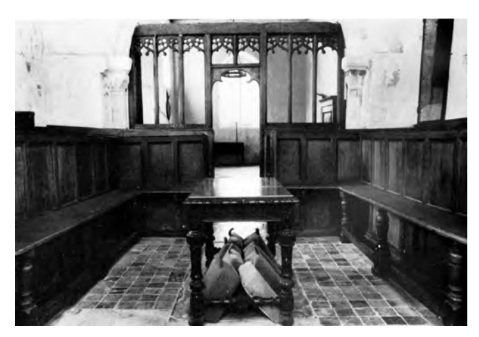
7. Chancel of Hailes Church, Gloucestershire. The communion table is set 'tablewise' in the chancel, as suggested in the second Book of Common Prayer.

suspended (for accidentally killing a gamekeeper) and the archepiscopate was exercised by a commission.