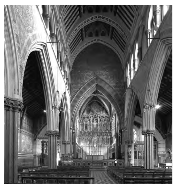
11. 'A Model Ecclesiological Church': All Saints', Margaret Street, London, by William Butterfield

congregation that 'no church allows for such diversity of doctrine as the Church of England'. Nevertheless, the altar frontal had to be removed before the consecration and a table cloth hurriedly obtained. The Ecclesiologists were pleased with Butterfield's work: