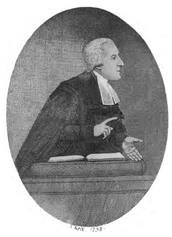
9. Charles Simeon was the formative influence behind Anglican Evangelicalism

and over 18,000 had been settled there by 1825. Members of the Clapham Sect were also responsible for founding the British and Foreign Bible Society which rapidly set about providing Bibles in different languages for the newly planted churches.