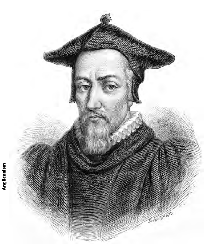
6. Richard Hooker was the greatest theological defender of the Church of England as a national church

fundamental, Hooker was able to show how God had given to his creatures the capacity to establish laws for regulating their affairs which were not based directly on revelation, but on reason. While some forms of law are necessary for human survival, there are others which reason teaches to be 'fit and convenient'. An example is the law of inheritance: each society needs a clear system of inheritance in which no rational law is transgressed, although these laws vary from commonwealth to commonwealth. Without this