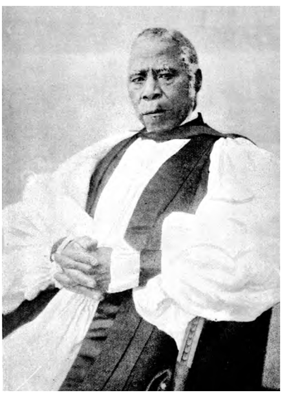
13. Samuel Adjai Crowther, first black bishop in the Anglican Communion

leadership. A small group of well-educated local clergy, some of whom had adopted English names, were later to be central in the missionary movements along the Niger River. Many retained knowledge of their African language, which allowed them easier contact with the local population. Central to Venn's strategy of 'a native church under native pastors and a native episcopate' was Samuel Crowther (Figure 13), ordained in 1843, who opened the first mission station in the Niger Delta in 1845.