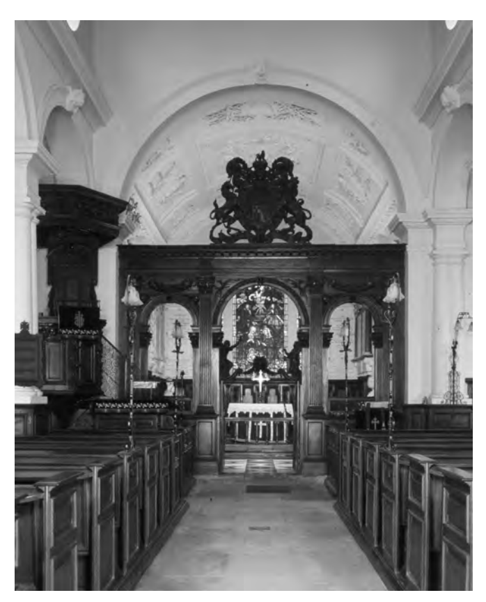
8. St Mary's Church, Ingestre, Staffordshire, by Christopher Wren. To receive communion one has to pass under the royal coat of arms – the national church has become the established church.

raised questions about the role of the King as Supreme Governor of the Church of England. Cranmer's dilemma returned: so much energy had been invested in the Stuart family and in their divine right to rule, that when it was fatally compromised there was little choice but to support the coup d'état of 1688 which brought William and Mary to the throne.